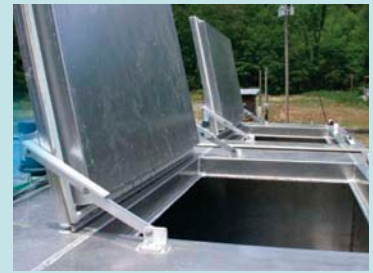
Photos 1 (left) and 2: The lids of live tanks on hauling trucks can fall if the truck moves. One farmer used pneumatic hinges to eliminate the hazard.