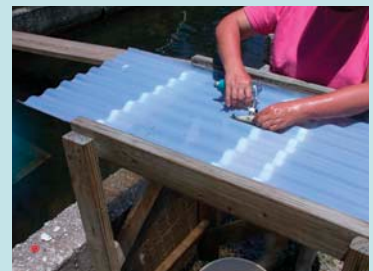
Photos 5 (left) and 6: Vaccinating fish on a flat tabletop can pose inadvertent needlesticks. Farmers have used a corrugated tabletop to better secure fish, thus reducing the likelihood of inadvertent needlesticks.

a problem. This is a difficult problem to solve, but one farmer made the point that maintaining distance from other vehicles is an important intervention. More sophisticated interventions are possible, including electronic distance warning devices.