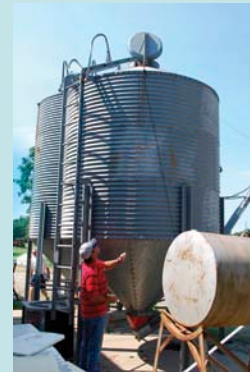
Photos 3 (left) and 4: A fall hazard exists when climbing the ladder on elevated feed bins in order to access hatches. Many farmers eliminate the hazard by installing a ground-level pull handle.